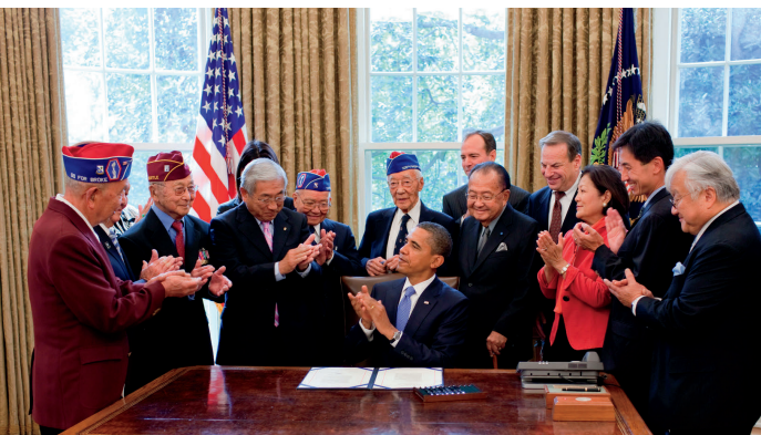
2011: President Obama signs the Congressional Gold Medal bill