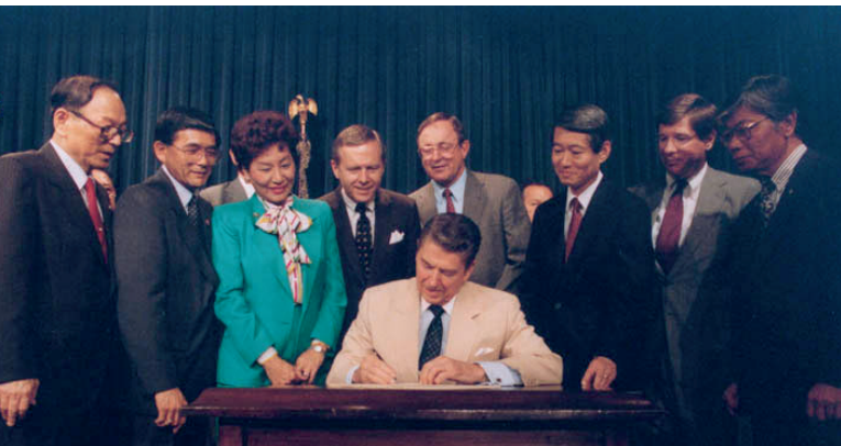
1988: President Ronald Reagan signs the Civil Liberties Act of 1988

Won what we thought was impossible: Redress via the Civil Liberties Act of 1988 and reparations of $20,000 per survivor.